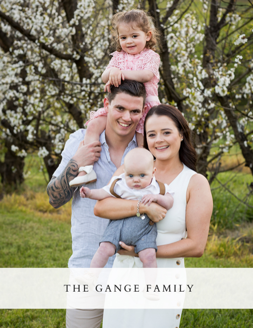
THE GANGE FAMILY